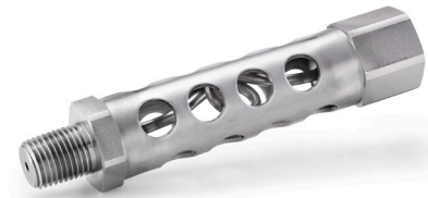
2098 Mini-MicroTube™ Siphon