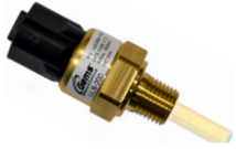
ULS-200 Solid-State Level Sensor