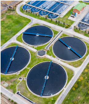
Water & Wastewater