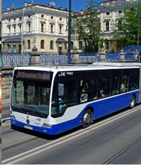
Buses & Recreational