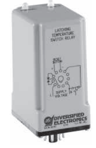
Temperature Switch Relay

The non-volatile Latching Temperature Switch relay monitors a normally-closed-low temperature switch. It incorporates a bistable relay that retains its state during power failures. LEDs indicate the status of the relay, and connections for an external reset button are provided for manual control. The reset inputs of multiple units may be connected to a single push button as long as proper polarity is observed when making the connections. Under normal conditions the temperature switch is closed and the relay is de-energized. When the temperature switch opens, the relay energizes and latches on until the temperature switch re-closes and the reset button is pressed. The unit will function properly with zero to 2k \Omega of resistance in series with the temperature switch.