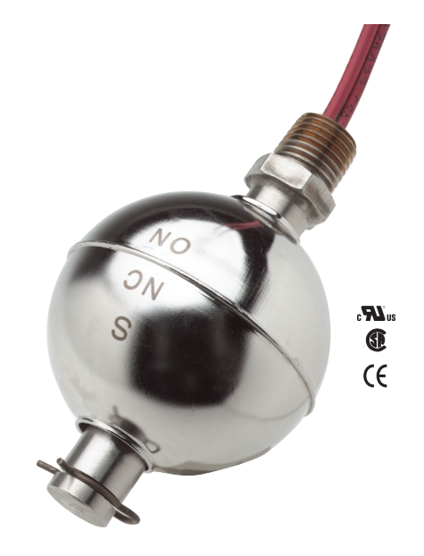
Exceptionally accurate and rugged for higher temperatures and in pressurized or corrosive liquids. For oils, water and chemicals.

†L,= Switch actuation level, nominal (based on a liquid specific gravity of 1.0 and N.O. dry circuit – dimension will vary for N.C. circuit).