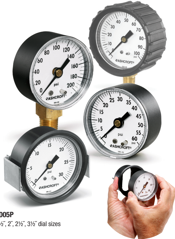
1005P 1½", 2", 2½", 3½" dial sizes